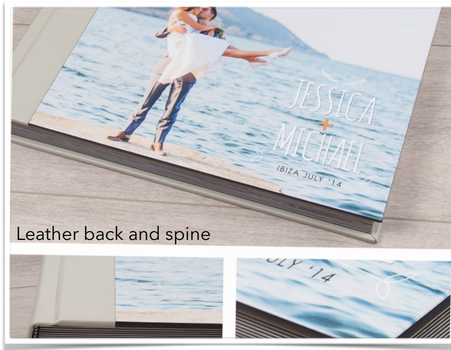
Leather back and spine